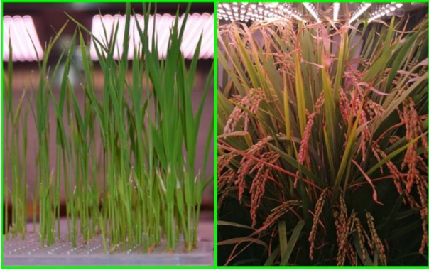
Transgenic Rice Growing