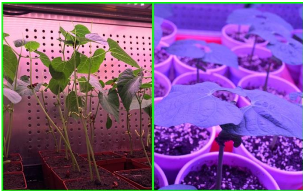
Magic Bean Growing